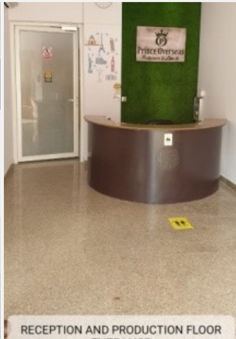
RECEPTION AND PRODUCTION FLOOR